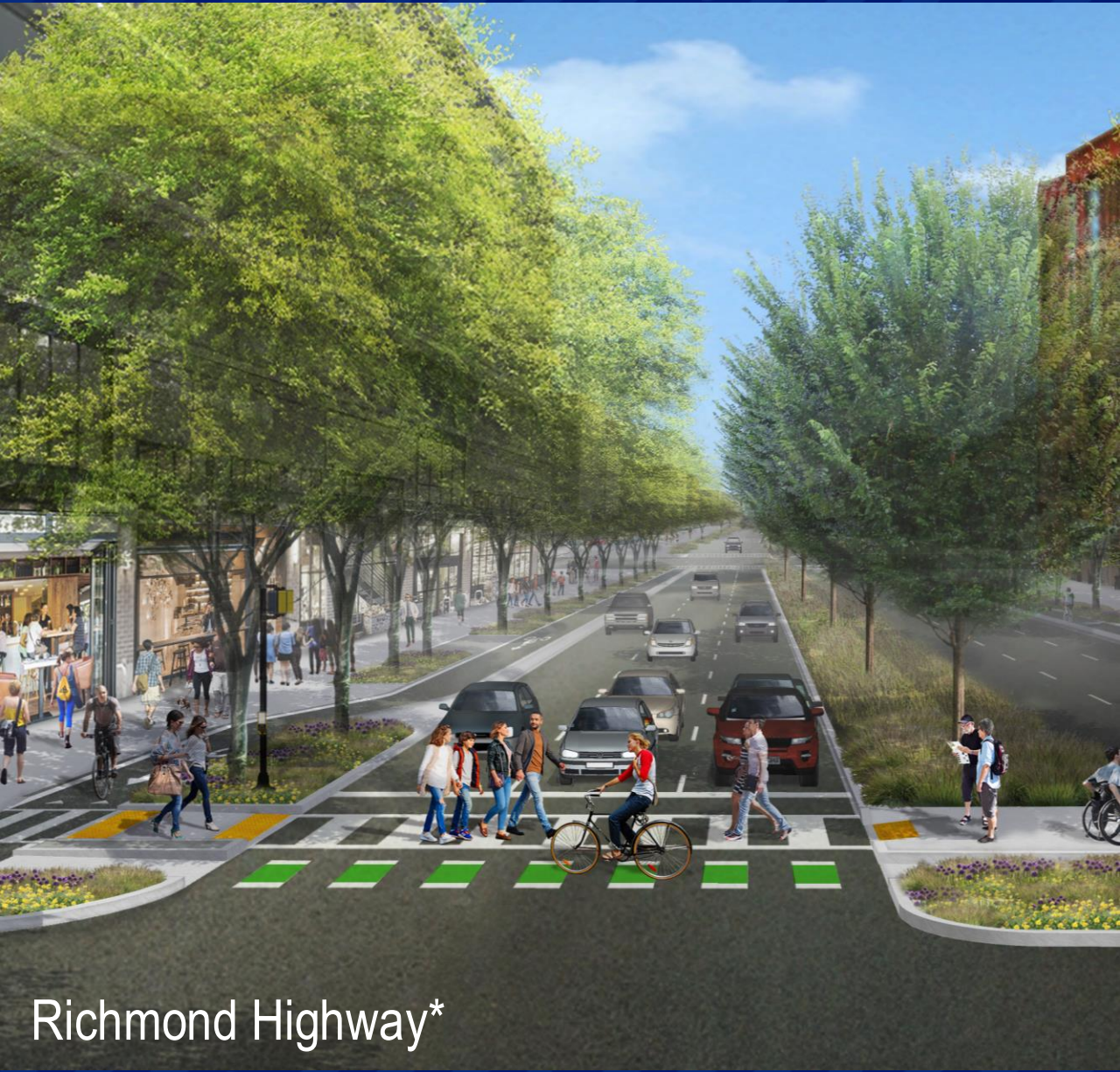
CC2DCA Multimodal Connector*